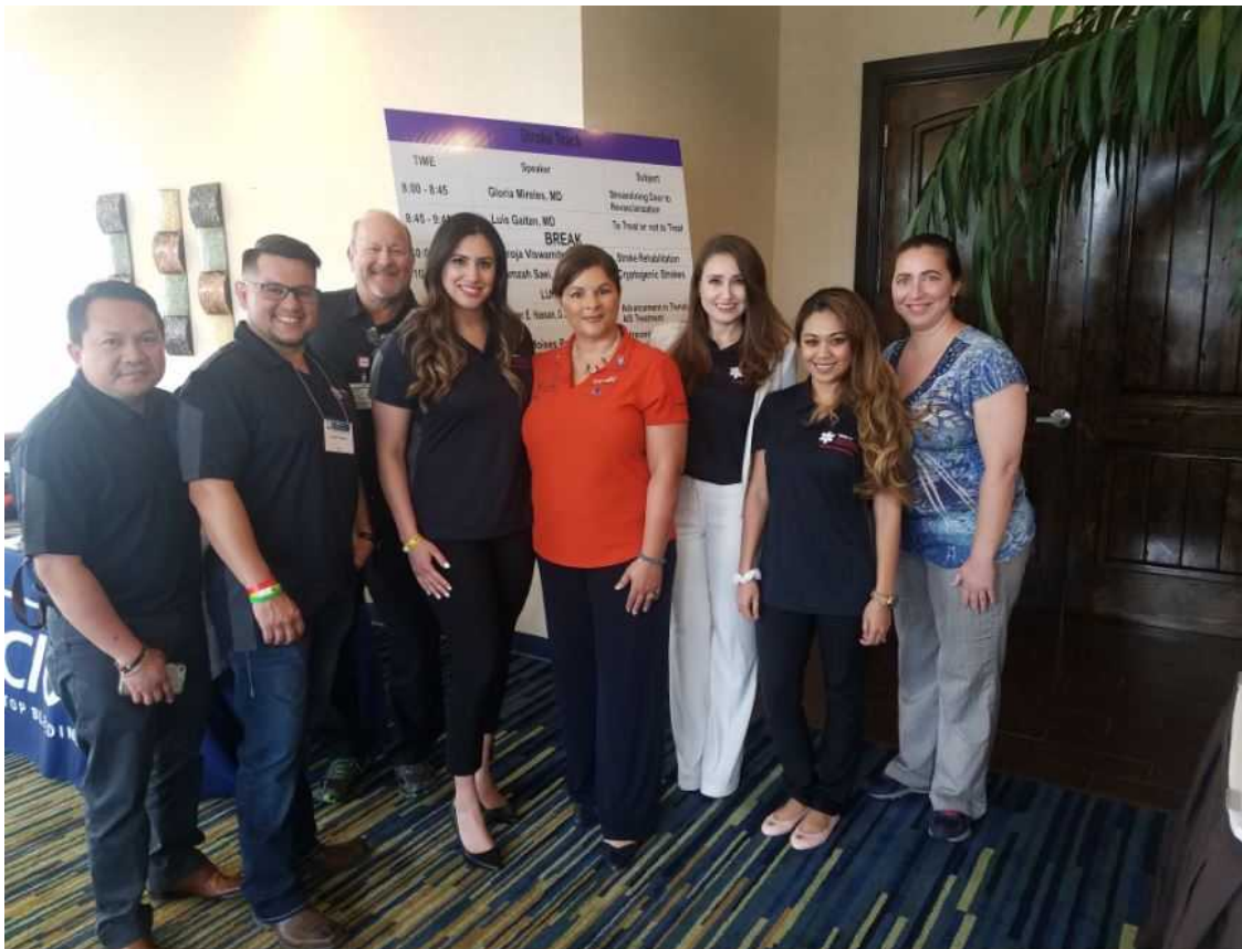
PHOTO SPOTLIGHT: TRAC-V recently hosted a successful healthcare symposium in South Padre with more than 250 attendees. Tracks included Trauma, Stroke, Cardiac, Perinatal and an additional EMS day.