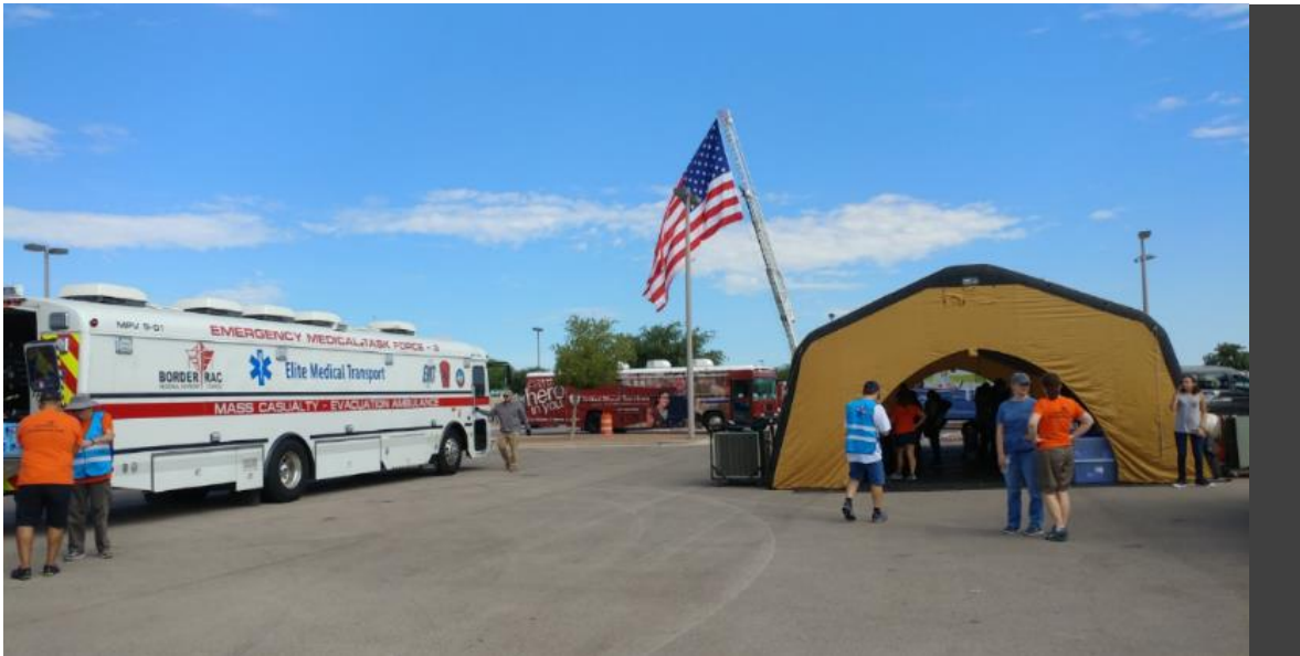
PHOTO SPOTLIGHT: BorderRAC recently participated in the 4th Annual Northeast Community Fair in El Paso. Attendees were able to visit the EMTF 9 mass casualty evacuation ambulance and learn about regional emergency preparedness.